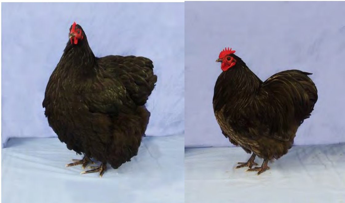
Champion Orpington in Show- Standard Black Pullet – Sonya Ford Reserve Orpington in Show – Bantam Blue Cockerel – Vicki Jerrett

For all information about the Orpington Club of Australia go to; www.orpingtonaustralia.com