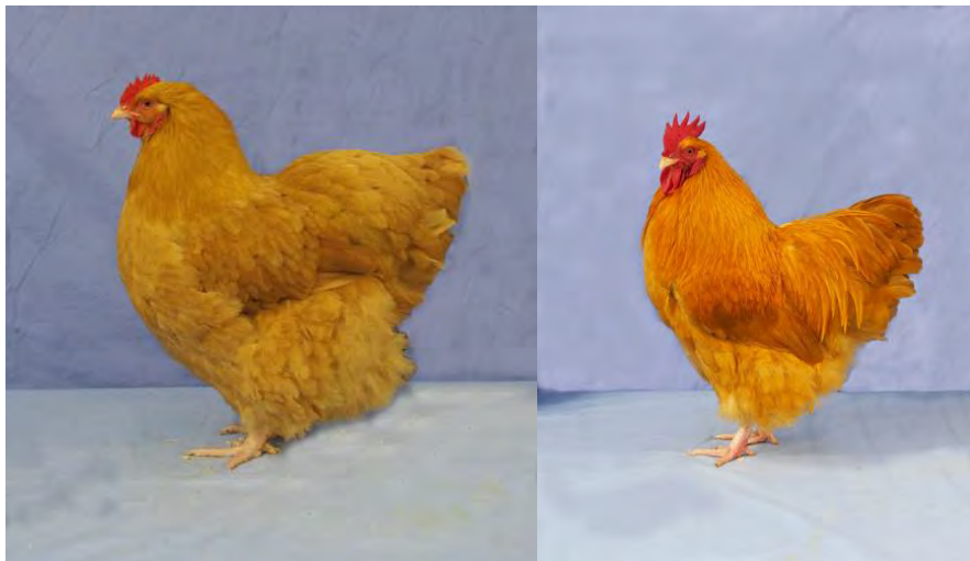
Reserve Champion Orpington Large- Buff Pullet – Simon Bevan Reserve Champion Orpington Bantam – Buff cockerel – Blue Callinan