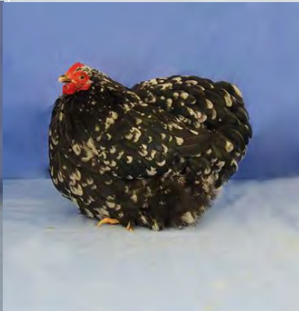
(L-R) Champ Standard Blue Champ Standard Cuckoo Champ Standard Splash Champ AOC (Red) Champ Bantam Black Champ Bantam White Champ Bantam Splash Champ Bantam AOC (Mottle)